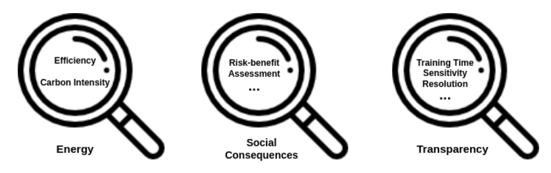
Figure 1. Lenses of the proposed sustainability framework.

Energy: (a) Efficiency: Where hardware specifications allow, the amount of energy consumed to train and retrain a model should be reported. If that is not possible, other indicators of energy consumption, like a combination of runtime and the hardware used, should be substituted. (b) Carbon<sup>3</sup> intensity: When publicly available, the power-generation source should be disclosed, for example, "carbon-friendly" solar, hydro, or wind vs. "carbon-intensive" fossil fuels. If possible, an estimate of the carbon emissions generated as a result of the computations in the paper should be made available. Ideally, research would also report energy costs together with the carbon intensity of the data centers used so that they can be openly compared to alternative setups.