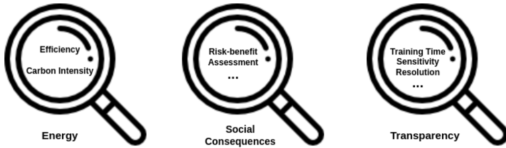
Figure 1. Lenses of the proposed sustainability framework.

Energy: (a) Efficiency: Where hardware specifications allow, the amount of energy consumed to train and re-train a model should be reported. If that is not possible, other indicators of energy consumption, like a combination of runtime and the hardware used, should be substituted. (b) Carbon 3 intensity: When publicly available, the power-generation source should be disclosed, for example, "carbon-friendly" solar, hydro, or wind vs. "carbon-intensive" fossil fuels. If possible, an estimate of the carbon emissions generated as a result of the computations in the paper should be made available. Ideally, research would also report energy costs together with the carbon intensity of the data centers used so that they can be openly compared to alternative setups.